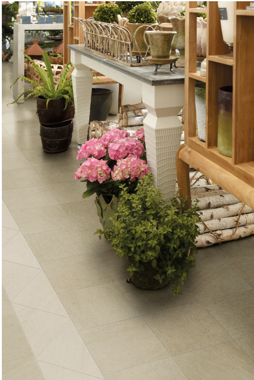
AV291 ▶ Silica 12 x 12 UPS AV292 ▶ Caldera 12 x 12 UPS