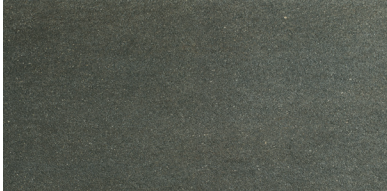
AV295 ▶ Magma