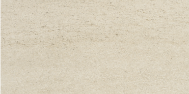
AV291 ▶ Silica