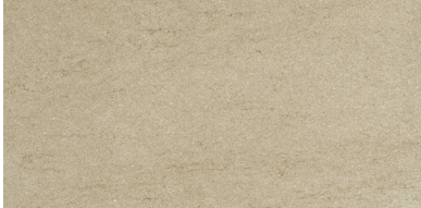
AV292 ▶ Caldera