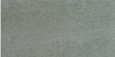
AV293 ▶ Bedrock