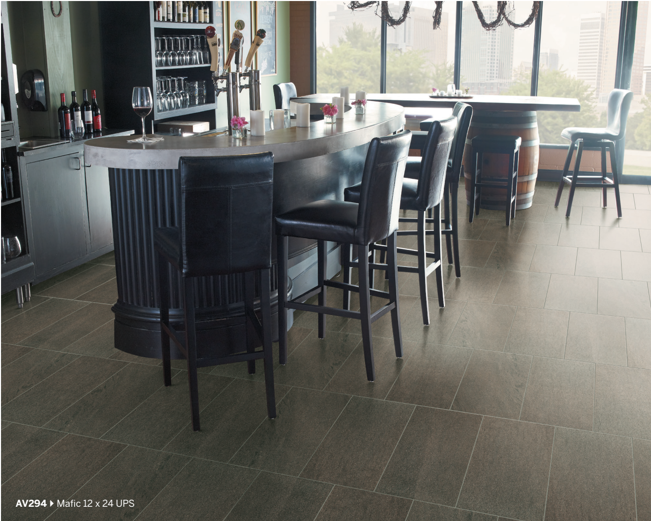
AV294 ▶ Mafic 12 x 24 UPS