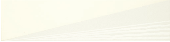
SNP01 ▶ Cotton Left