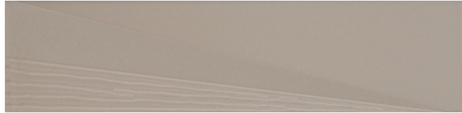
SNP12 ▶ Warm Silver Right