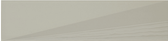
SNP03 ▶ Stone Left