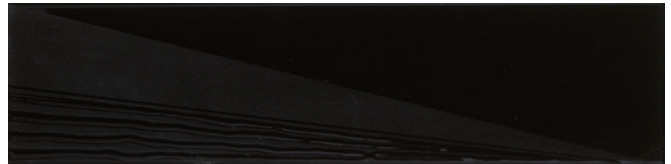
SNP04 ▶ Coal Right