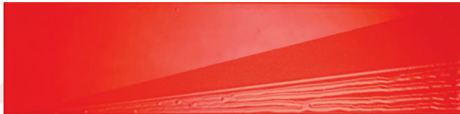
SNP23 ▶ Lipstick Left