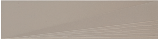
SNP12 ▶ Warm Silver Left