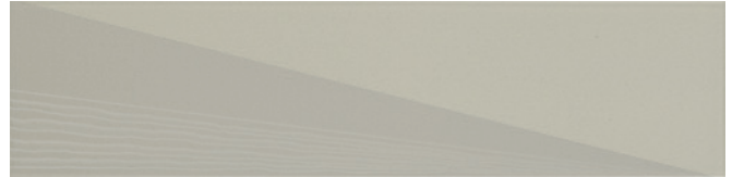
SNP03 ▶ Stone Right