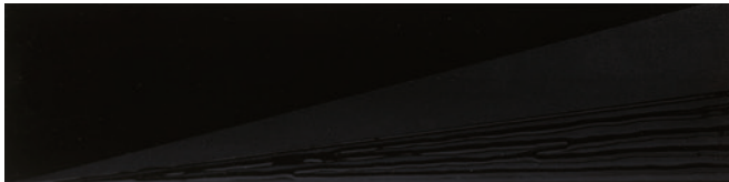
SNP04 ▶ Coal Left