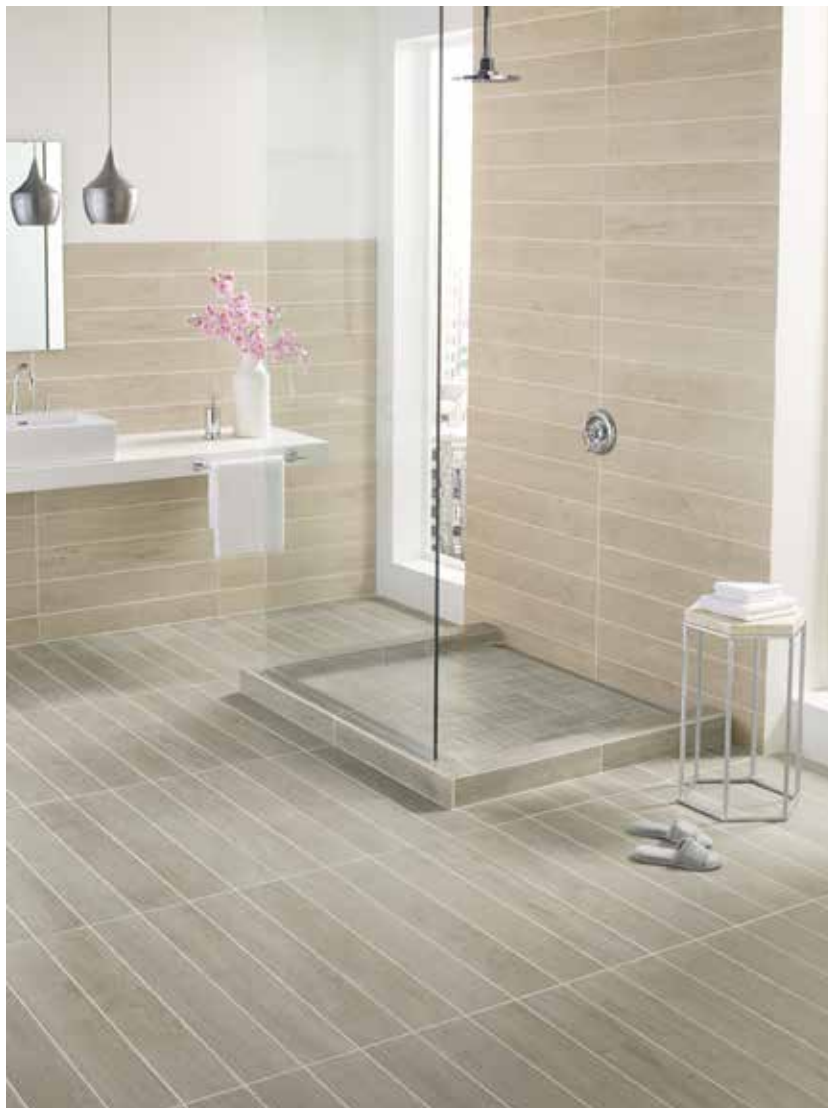
AV355 ▶ Peaceful Oak 6 x 36 on floor NBC05 ▶ Peaceful in Oak and Olive Mix 1 x 6 Mosaics on shower floor AV354 ▶ Mindful Oak 6 x 36 on wall

Crossville Inc. guarantees that its products will meet or exceed the performance specifications outlined in ANSI A137.1-2022 and in the performance data section of the Crossville, Inc. general product catalog. For complete details check our website at CrossvilleInc.com.