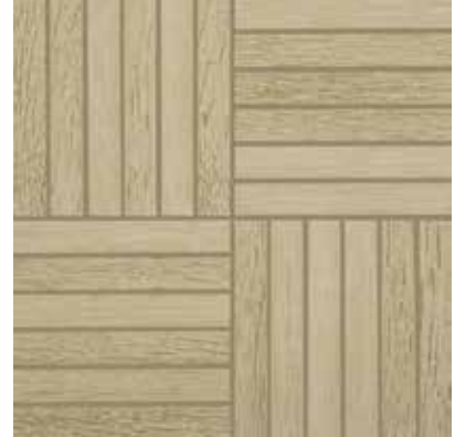
NBC03 ▶ Blissful in Oak and Olive Mix 1 x 6 Mosaics