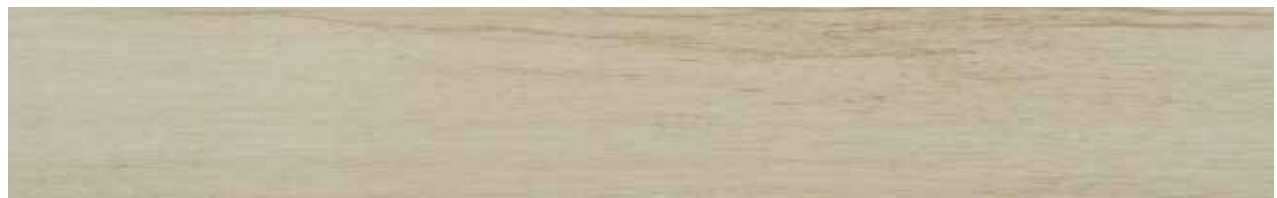
AV364 ▶ Mindful Olive