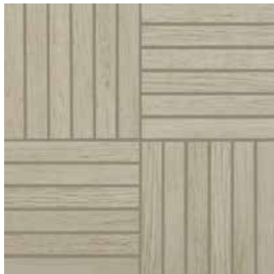
NBC04 ▶ Mindful in Oak and Olive Mix 1 x 6 Mosaics