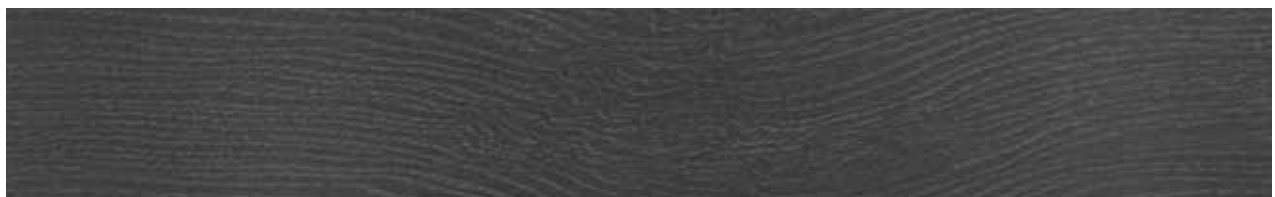
AV357 ▶ Meditative Oak