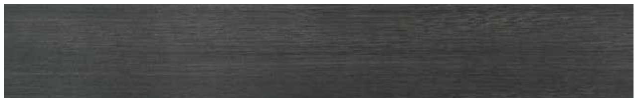
AV367 ▶ Meditative Olive