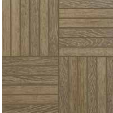
NBC02 ▶ Joyous in Oak and Olive Mix 1 x 6 Mosaics