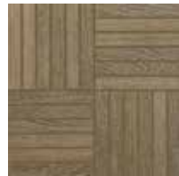
1 x 6 Mosaics (shown in NBC02) UPS Finish, 8 colors available Mesh mounted on a 297mm x 297mm sheet