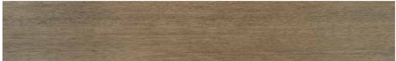
AV362 ▶ Joyous Olive