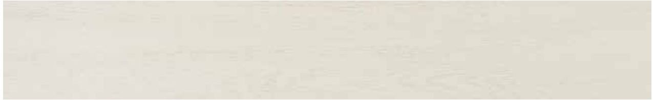
AV351 ▶ Levity Oak