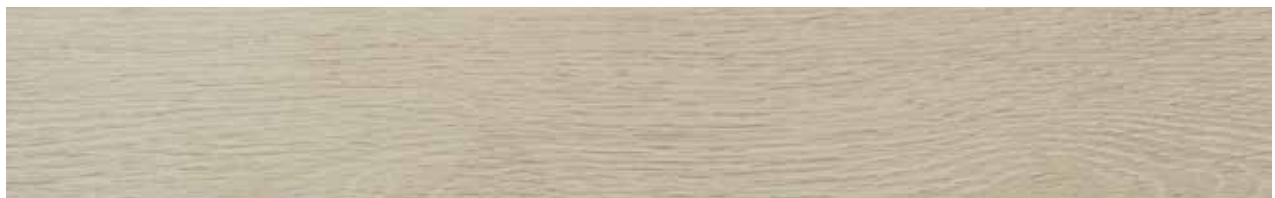
AV354 ▶ Mindful Oak