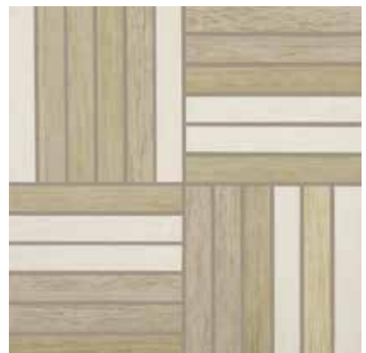
NBC08 ▶ Levity, Blissful, and Mindful in Olive Mix 1 x 6 Mosaics