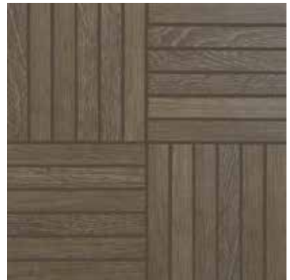
NBC06 ▶ Slumber in Oak and Olive Mix 1 x 6 Mosaics