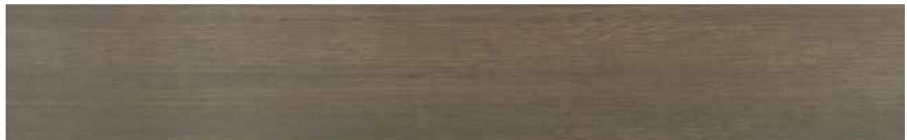
AV366 ▶ Slumber Olive