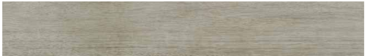
AV365 ▶ Peaceful Olive