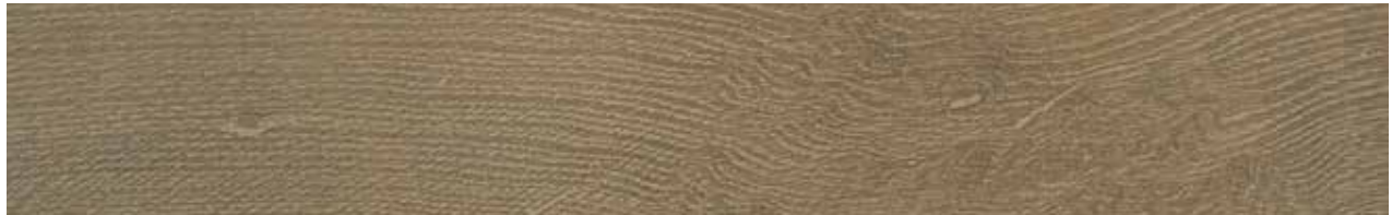
AV352 ▶ Joyous Oak