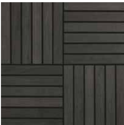
NBC07 ▶ Meditative in Oak and Olive Mix 1 x 6 Mosaics