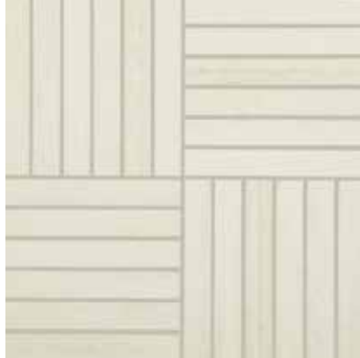
NBC01 ▶ Levity in Oak and Olive MIX 1 x 6 Mosaics