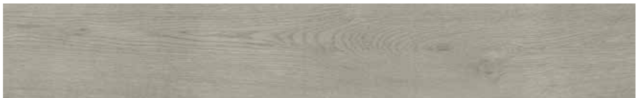
AV355 ▶ Peaceful Oak