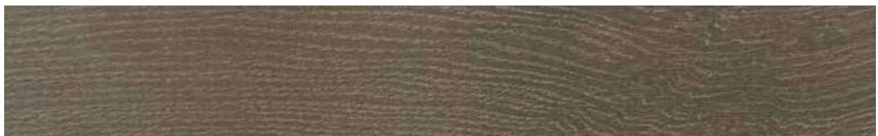
AV356 ▶ Slumber Oak