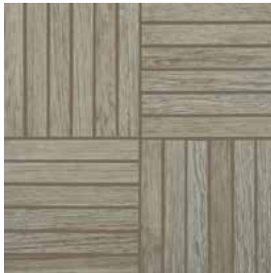
NBC05 ▶ Peaceful in Oak and Olive Mix 1 x 6 Mosaics