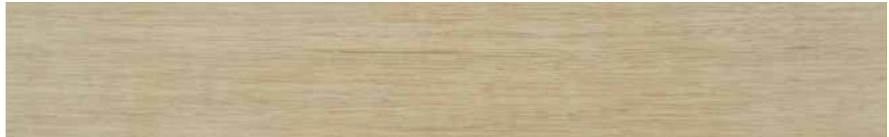
AV363 ▶ Blissful Olive