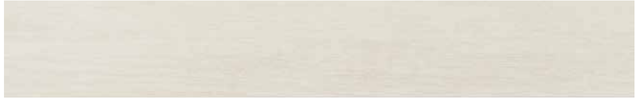
AV361 ▶ Levity Olive