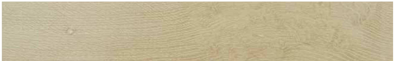
AV353 ▶ Blissful Oak