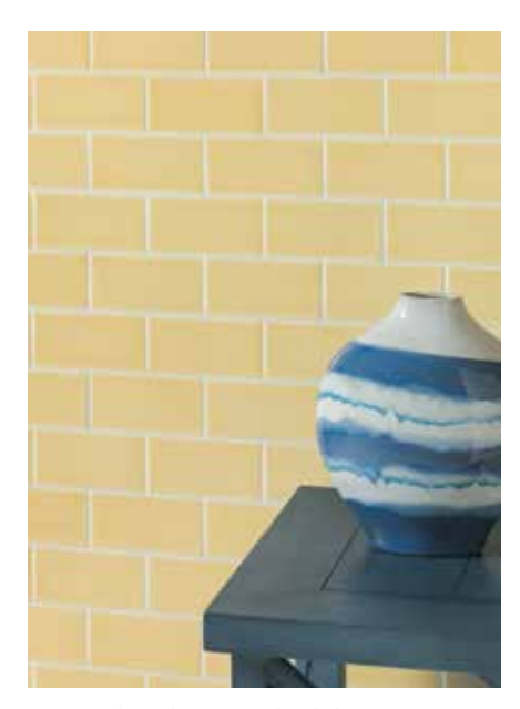
HWR07 ▶ Gold Leaf 3 x 6 Gloss