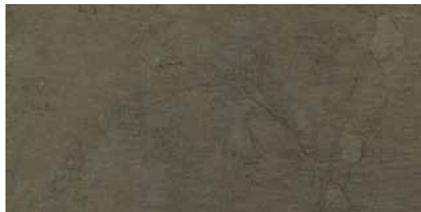
AV325 ▶ Dockside