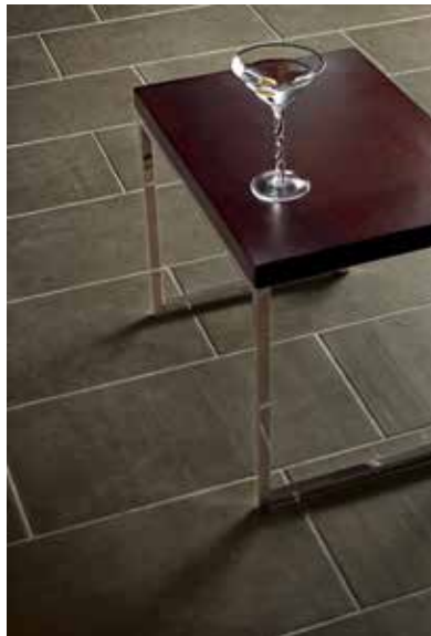
AV325 ▶ Dockside 12 x 24