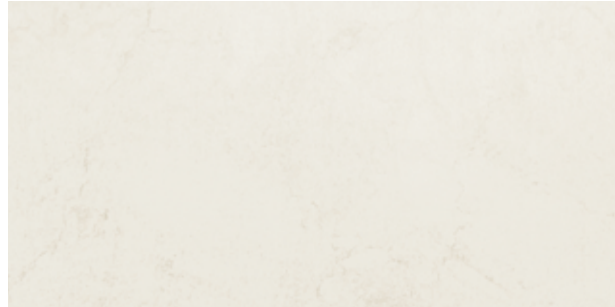
AV321 ▶ Lamp Post