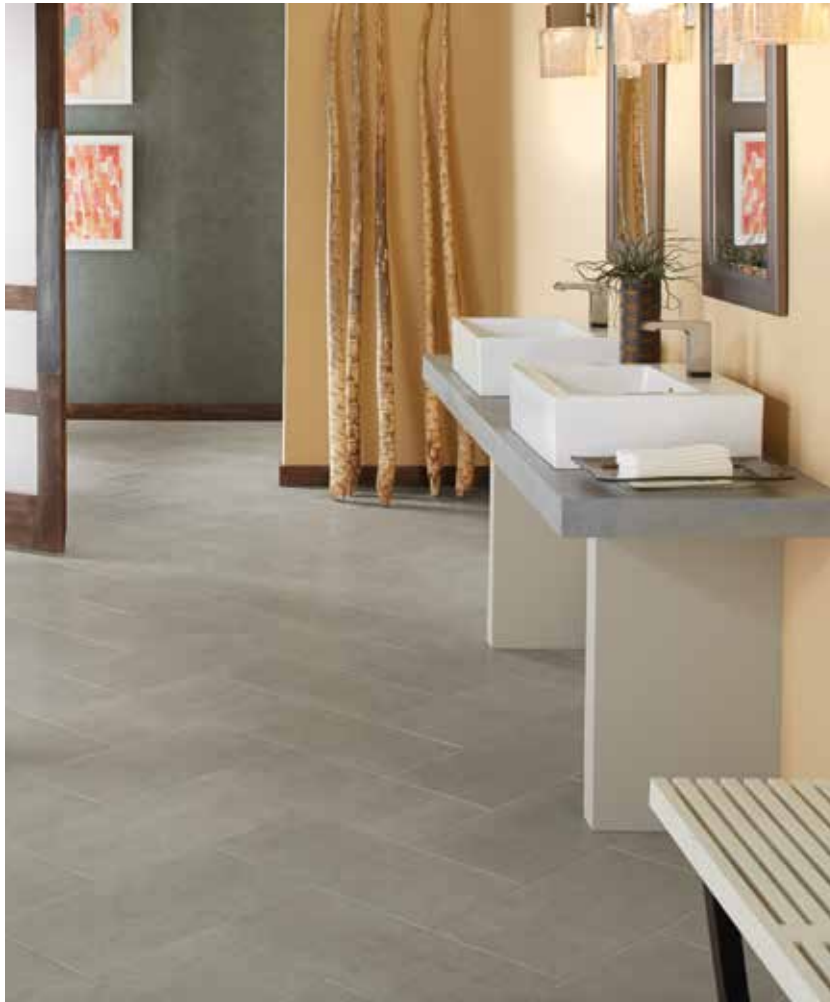
AV323 ▶ Clock Tower 12 x 24 L4338 ▶ Laminam by Crossville 5.6 Fokos - Piombo

Crossville Inc. guarantees that its products will meet or exceed the performance specifications outlined in ANSI A137.1-2022 and in the performance data section of the Crossville, Inc. general product catalog. For complete details check our website at CrossvilleInc.com .