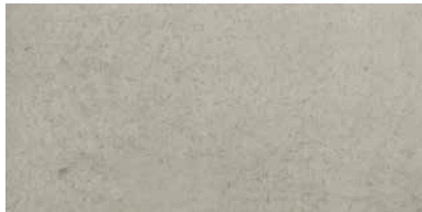
AV323 ▶ Clock Tower