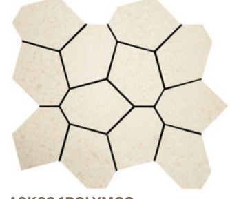
ASK02.1POLYMOS Bone Polygon Mosaic UPS