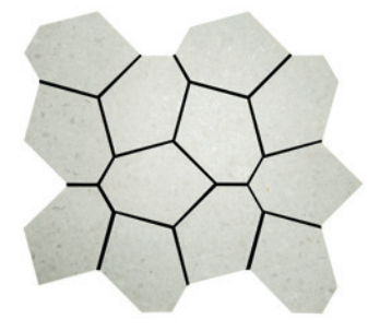
ASK04.1POLYMOS Glacier Polygon Mosaic UPS