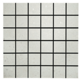
ASK04.10202MOS Glacier UPS