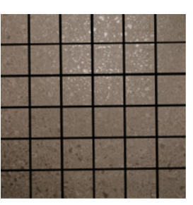
ASK03.10202MOS Mink 2x2 Mosaic UPS