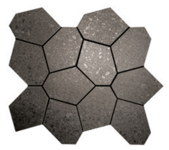
ASK05.1POLYMOS Tundra Polygon Mosaic UPS