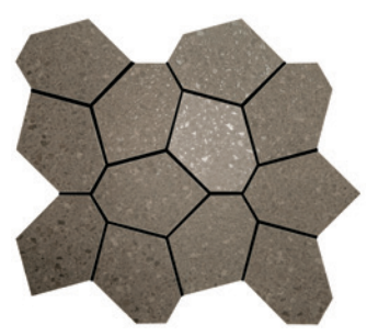
ASK03.1POLYMOS Mink Polygon Mosaic UPS