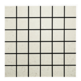
ASK01.10202MOS Ice 2x2 Mosaic UPS