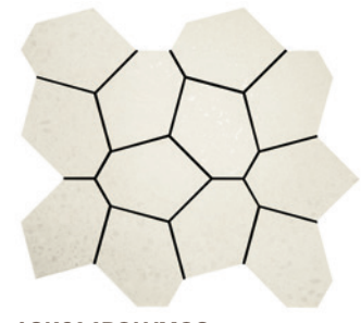
ASK01.1POLYMOS Ice Polygon Mosaic UPS