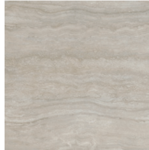
WBT05 ▶ Travertine Dove