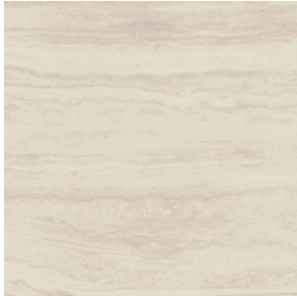
WBT01 ▶ Travertine White