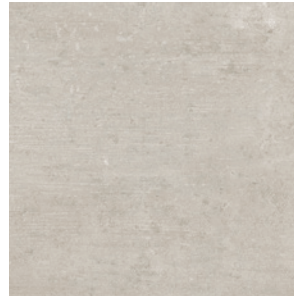
WBC05 ▶ Concrete Dove