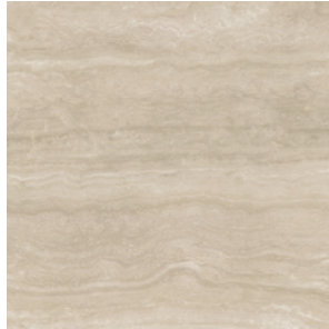
WBT04 ▶ Travertine Sand