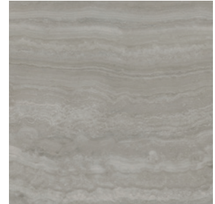
WBT06 ▶ Travertine Ash