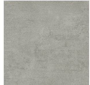
WBC06 ▶ Concrete Ash