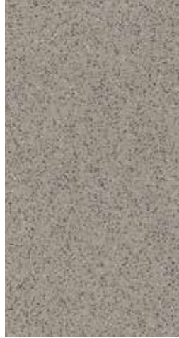
AP001 ▶ Grey Mingle*

* Grey Mingle is made from 30-35% recycled content