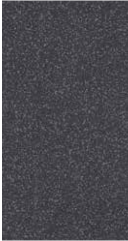
AP880 ▶ Onyx